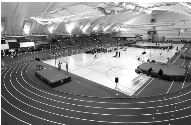
The Camp Randall Memorial Sports Center (The Shell) is the indoor home of the University of Wisconsin track and field teams.