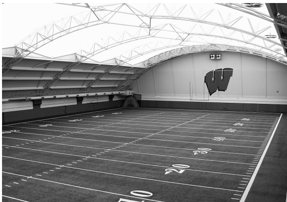
The McClain Center, which features an 80-yard indoor field, is an excellent training facility for both running and throwing.

Free parking is available in lot 17, the ramp north of Camp Randall Stadium, or on the street.